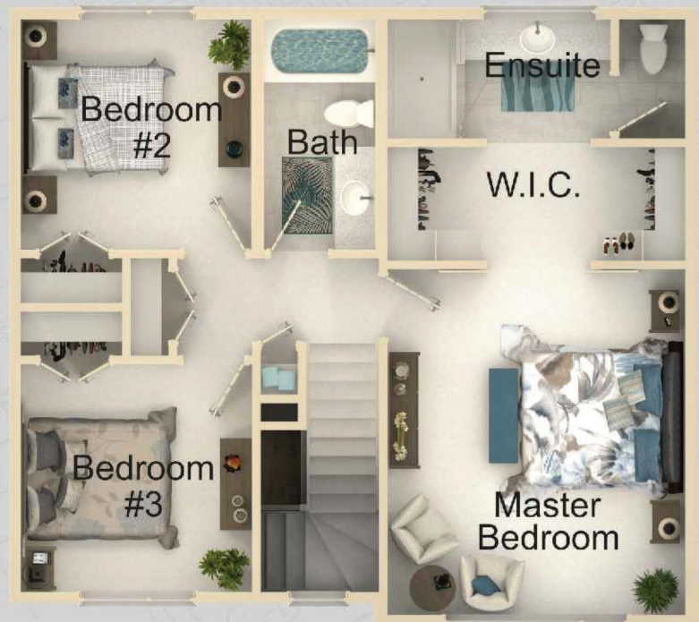
Second Floor 745 Sq.Ft.

NOTE: Artist's renderings do not reflect actual home specifications.